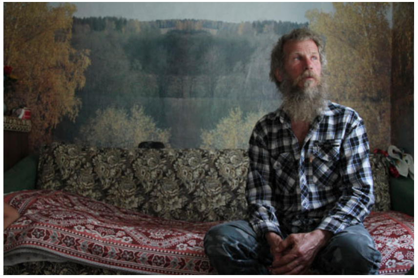
© Clément Cogitore / ADAGP, Paris 2017