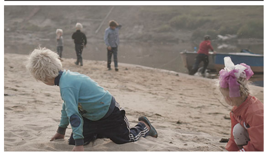
© Clément Cogitore / ADAGP, Paris 2017

If this world is doomed to perish, what does its disappearance really symbolise?